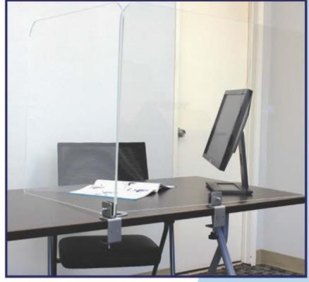
Training Table Protection