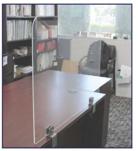
Desk Protection Panel