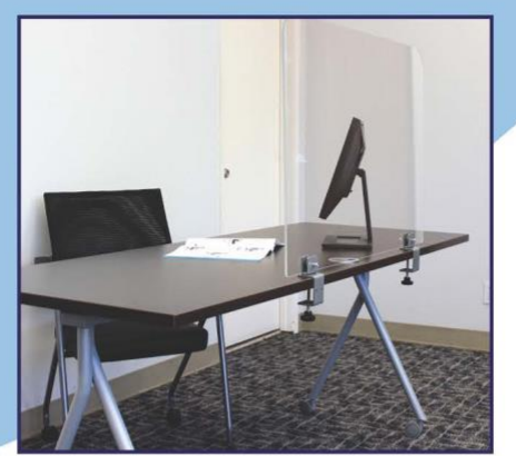
Front Panel Protection

Designed to protect from microbial transmission in your workspace Exciting NEW Product <u>AVAILABLE NOW</u>