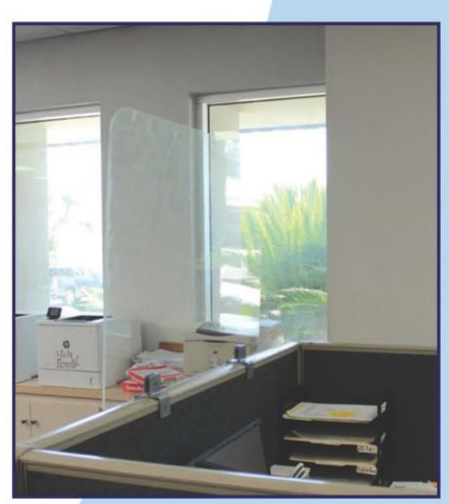
Cubicle Mount Protection